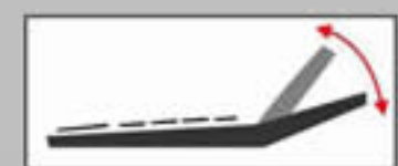
Adjustable Tilt Display