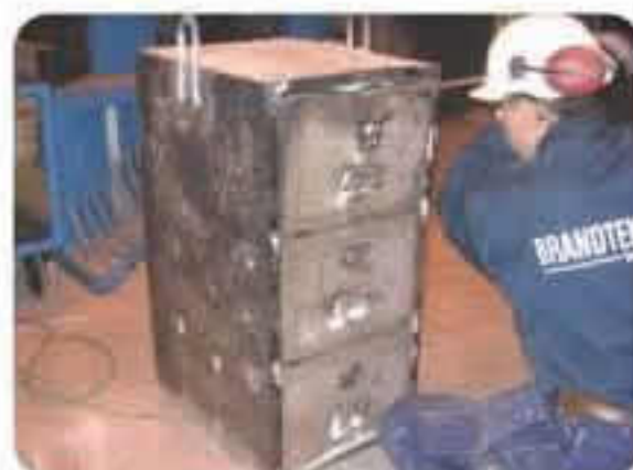
③ After test I