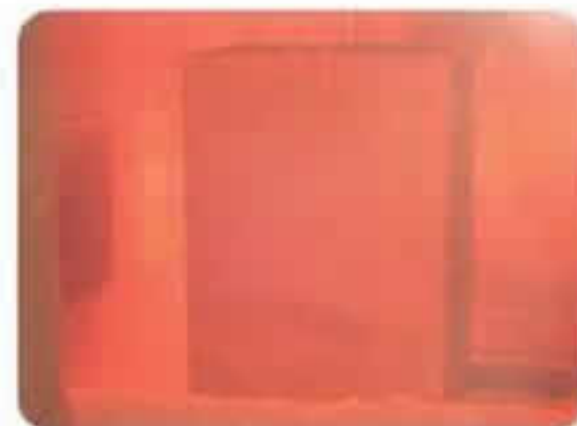
② In the furnace on test