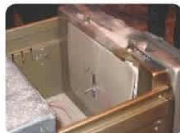
④ After test II