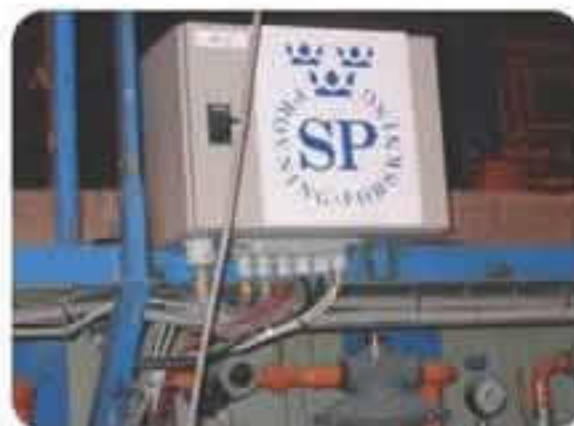
① SP Laboratory